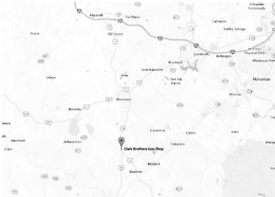
Directions to Clark Brothers