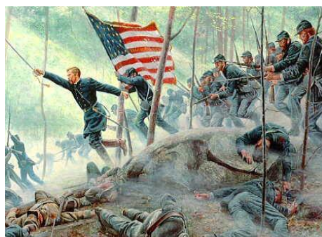
Colonel Joshua Chamberlain leading Union troops in the course of Pickett's Charge.