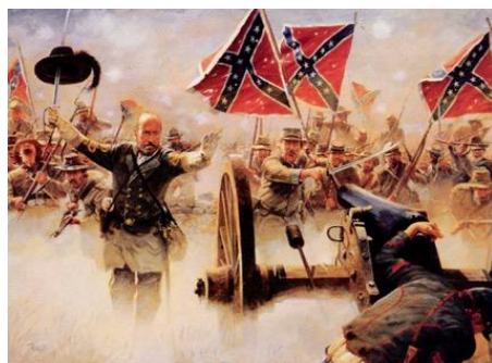
General Lewis Armistead seizing a Union cannon in the battle for Little Round Top.