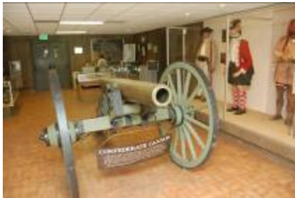
Confederate Civil War cannon