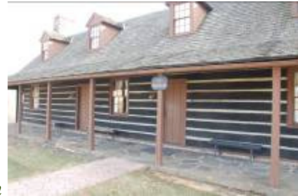
The CCC Museum